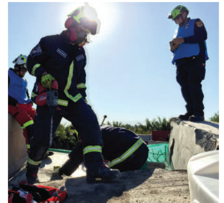
IEC Bomberos de Chile, first Latin American team to classify.