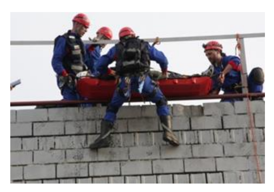
Figure 4: Team practicing a Height Rescue operation.

The exercise should be designed making use of constantly evolving realistic structural collapse scenarios and is not to be an exercise that demonstrates individual technical skills (staging the exercise using prefixed skill-performance stations). The simulated disaster exercise is required to encompass all the key stages of international disaster response.