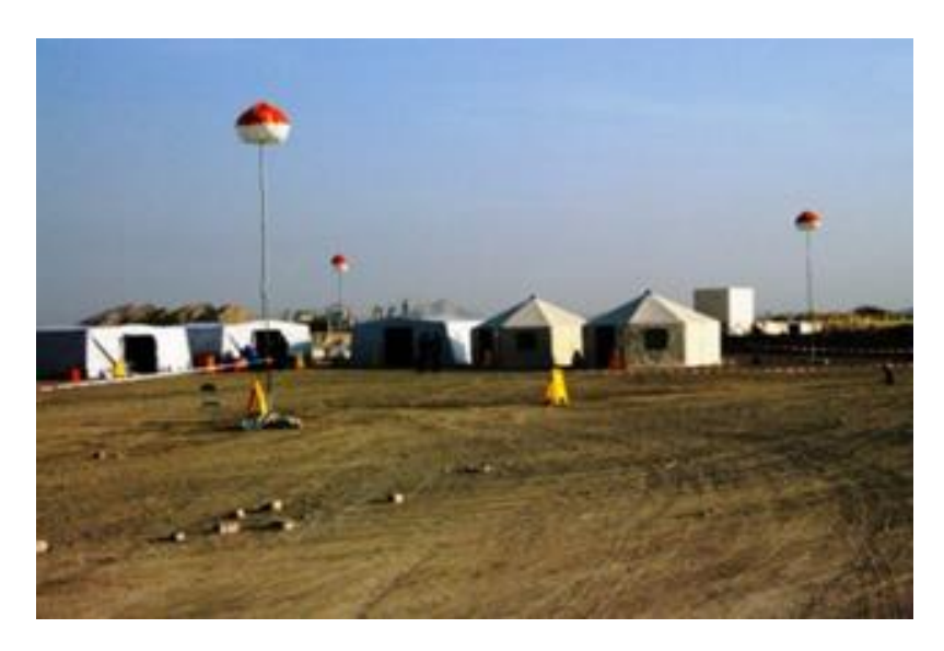
Figure 6: A Team's Base of Operations.