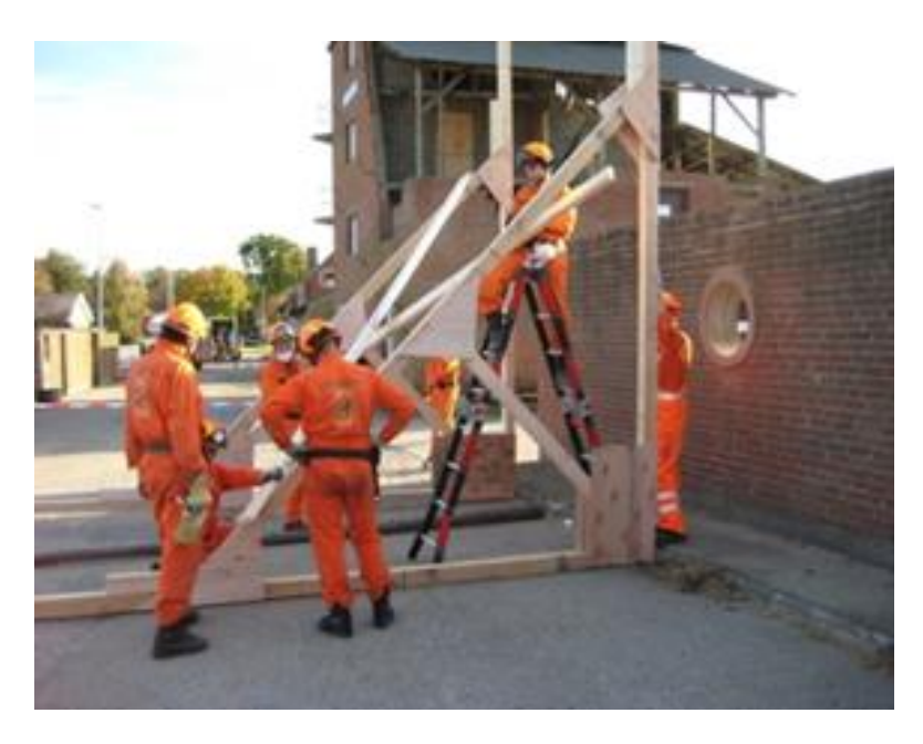
Figure 3: Team undergoing the 36-hour IEC Exercise.