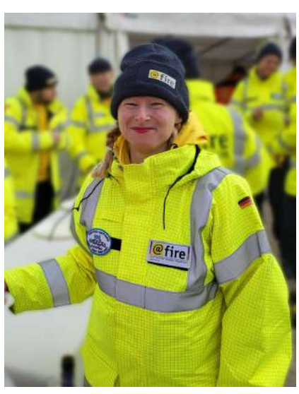
@Fire Germany, First Light Team Classification, NOV 2021.

This year also gave the network the opportunity to reflect on and commemorate the past 30 years of its achievements, especially during the third INSARAG Global Meeting (IGM), co-hosted virtually by the Government of Poland and the INSARAG Secretariat