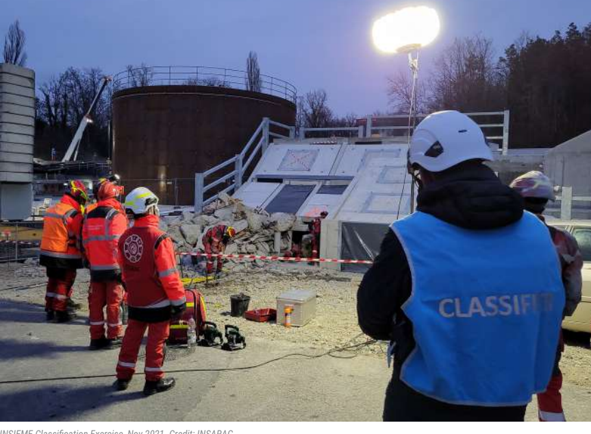
INSIEME Classification Exercise, Nov 2021.