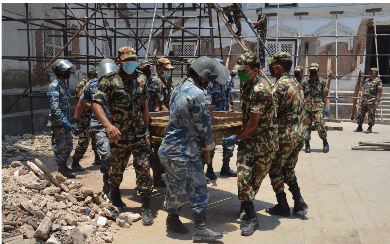
Rescue of a golden throne post-earthquake in nepal.