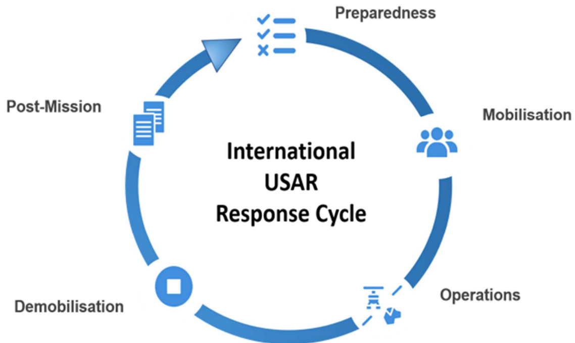
Fig. 1: The INSARAG International Response Cycle (INSARAG Guidelines 2020 Vol. II, Manual B, p. 6)