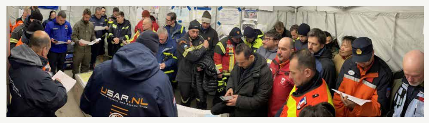
UCC USAR coordination in Hatay

Looking forward to 2024, a comprehensive schedule of over 20 global events are being planned, starting from the New Year Teleconference on the 17th of January, ten IEC/Rs and the INSARAG National Accreditation Process (IRNAP) in August for Argentina and in November for Ecuador.